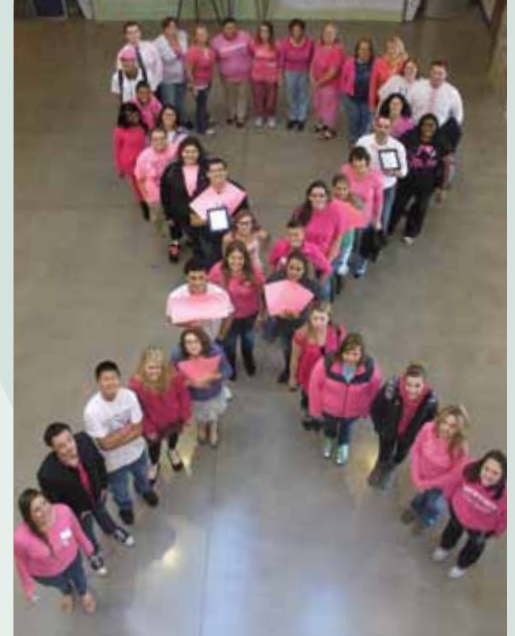
Finger Lakes Community College faculty, staff and students

“As part of Breast Cancer Awareness Month, the Finger Lakes Community College (FLCC) – Campus Activities Board wanted to honor those who have battled breast cancer, as well as those who are continuing to fight this terrible disease. Our members held gift basket raffles and sold pink ribbons to raise funds for Thompson Health because it is a great facility in our local community. The Sands Cancer Center has helped countless individuals whose lives have been touched by cancer – and many of our students’ loved ones have also had wonderful experiences with the Thompson staff.”